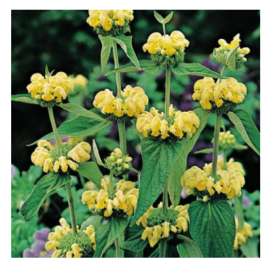
(bird nest amid the Phlomis & Phlomis when in flower)

When you walk through the garden, know that the seed heads following the flowers provide food, the pond and raingarden provide water, and the foliage provides the cover for their safety, as they nest or forage for seeds and insects. The varied scope of the three gardens, the Fern Display Garden, the Haiku Garden, and the Mixed Borden weave a tapestry of life and beauty. They also give us all a place of peace- if only for a few moments.